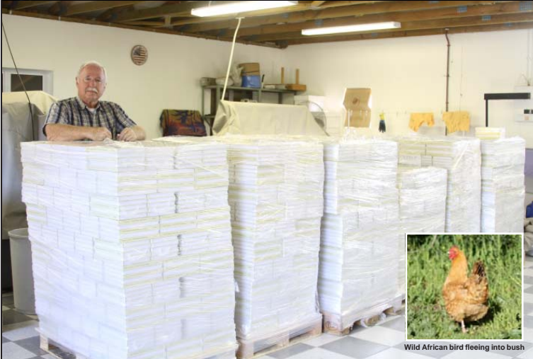
Wild African bird fleeing into bush