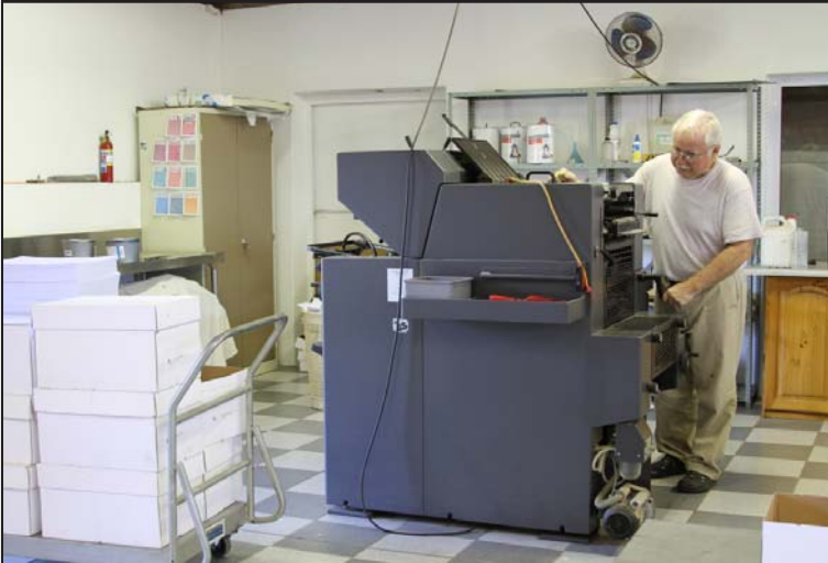
We have been operating this press for over 15 years. Chronicles are printed for both letter and bundle distribution. The electronic edition goes out as E-BOOKS.