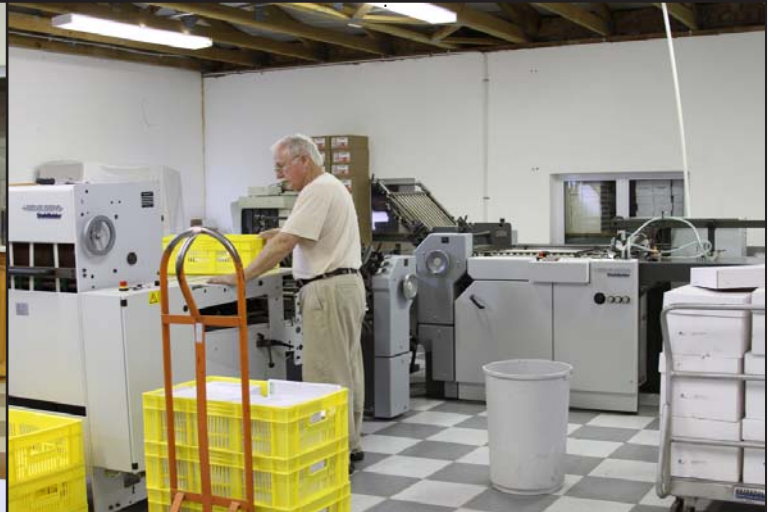
Once the African Chronicles come off the press, they then go to folding for envelopes and packaging in boxes to be shipped to distribution centers worldwide.