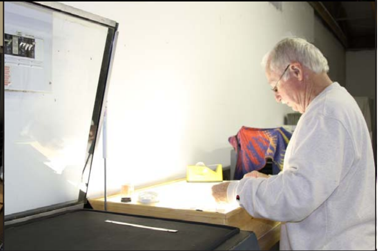
Transparencies are printed out, and then taken to the print shop for layout. From the layout of the transparencies, plates are burned for the press.