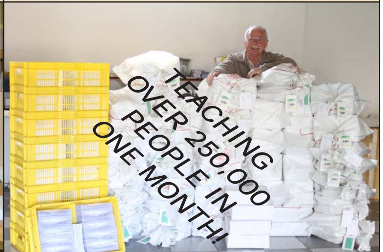
The printed edition is distributed to individuals through letters. Mail bags of Chronicles are sent to distribution centers throughout the world. Thousands go out as E-BOOKS.